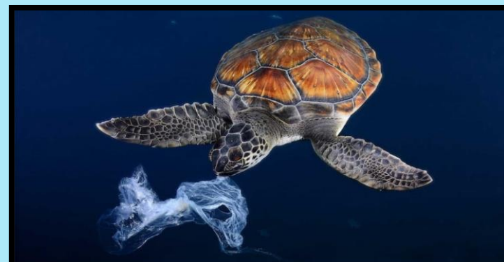
Sea turtles often mistake plastic bags for jellyfish.

Plastic bags are a major cause of environmental pollution . Plastic as a substance is non-biodegradable and thus plastic bags remain in the environment for hundreds of years polluting it immensely. It has become extremely essential to ban plastic bags before they ruin our planet completely. Many countries around the globe have either put a ban on the plastic bags or levy tax on it.