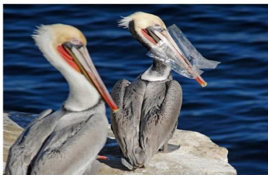
Sea birds like this pelican often mistake pieces of plastic for food.