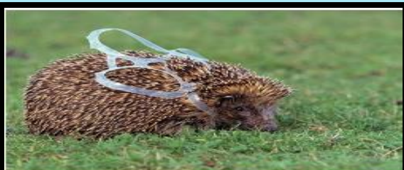
Both marine and terrestrial animals suffer from plastic waste—including soda rings.

Plastic bags are a major cause of environmental pollution . Plastic as a substance is non-biodegradable and thus plastic bags remain in the environment for hundreds of years polluting it immensely. It has become extremely essential to ban plastic bags before they ruin our planet completely. Many countries around the globe have either put a ban on the plastic bags or levy tax on it.